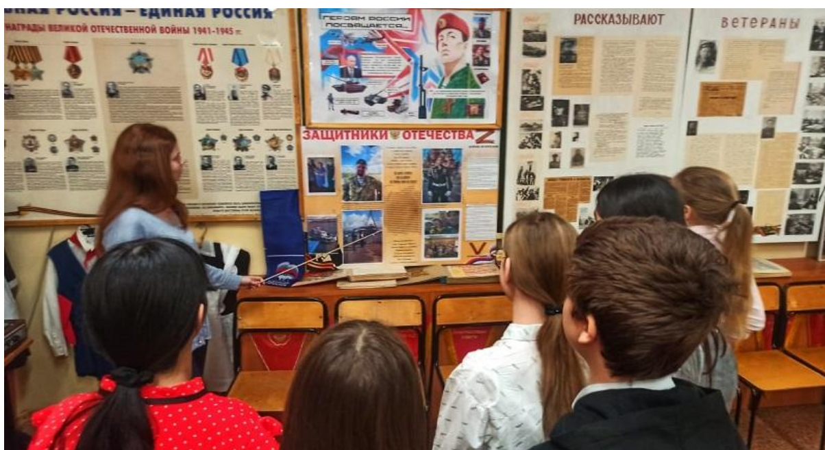
A teacher conducting a lecture on the “special military operation” at School 250 of St. Petersburg

The issue of political propaganda in schools is a growing human rights concern in Russia. It involves politicization of several subjects of the curriculum, most visibly History and the subjects relating to Social Sciences, and deliberate dissemination of misleading information and disinformation to shape the political views and beliefs of students. This practice undermines the educational system's integrity, affects quality of education and compromises the development of critical thinking skills among young learners. The Committee on the Rights of the Child, an independent body of experts overseeing implementation of the eponymous Convention, published its concluding observations in 2024 recommending that Russia “put an end to the politicization and militarization of schools” and “prevent any attempt to rewrite school curricula and textbooks to reflect the political and military agenda of the Government”. It noted with particular concern “the interference of the ruling party in the educational process and the creation of ‘hero’s desks’ 33 to provide positive information about the participants in the armed conflict in Ukraine”, “widespread and systematic State propaganda in schools about the armed conflict in Ukraine, including the introduction of a new history textbook, a new school subject entitled ‘Conversation about important things’ 34 and a new training manual for teachers conveying the Government’s position on the armed conflict in Ukraine”. 35