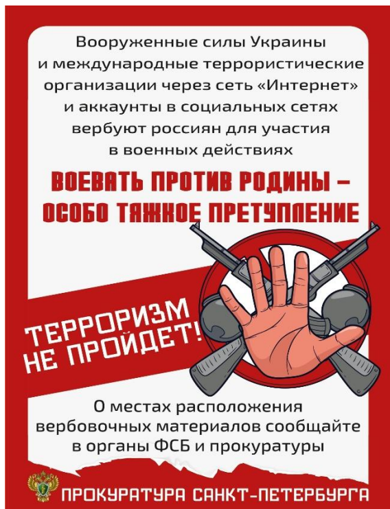
A placard by the St. Petersburg Prosecutor's Office warning about alleged efforts of Ukrainian military to recruit Russians online and implying that participating in hostilities on the side of Ukraine amounts to terrorism

The informal screening of political and other personal views of pupils and students in Russian schools is commonplace and is often framed by the administrations and educational authorities as so-called “profilaktika”, or preventative, prophylactic measures against “terrorism”, “extremism” and other “destructive ideologies”. The definition of “extremism” in the Russian law is unduly broad and vague and potentially encompasses any peaceful protest or political or social activity and expressed opinion critical of the Russian authorities. Among the groups and organizations that have been arbitrarily designated and criminalized as “extremist” are the Jehovah’s Witnesses, Aleksei Navalny’s Anti-