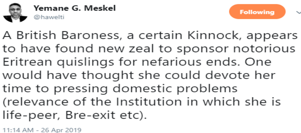
Figure 4: Tweet by Yemane Gebre Meskel, Minister of Information

democracy in Eritrea following the rapprochement with Ethiopia. 69